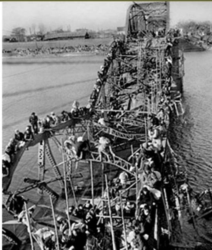
Flight of Refugees Across Wrecked Bridge in Korea on Dec 4, 1950.

December 5, 1950: The last United Nations troops left Pyongyang, as the British 29 th Independent Infantry Brigade covered the retreat of the U.S. 25 th Infantry Division and the South Korean 1 st Infantry Division troops that had been between the Yalu River