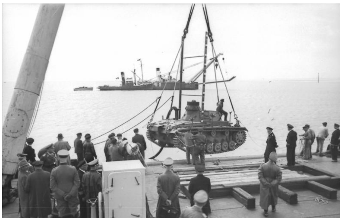
The much-publicized photo of a Panzer III Tauchpanzer under testing to be used in Operation Sea Lion.

July meeting is our Annual KIT AUCTION! The rules are simple: only non-started kits with all the parts and something you would build yourself (see details below).