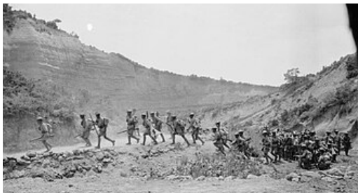
Gurkhas of the 29th Indian Brigade charge through Gully Ravine

Two soldiers of the 1 st Battalion, the Royal Inniskilling Fusiliers, Captain