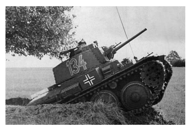
Panzer 38(t) in France, 1940

The 38(t) was not a German designed or built tank; it had been acquired from Czechoslovakia after German annexation. Thus the 't' being the German designation for Czech. This tank proved to be a better than the German Panzer I and Panzer II. And with the need to equip a rapidly expanding army, Germany had over 1,400 of them produced by the Czechs.