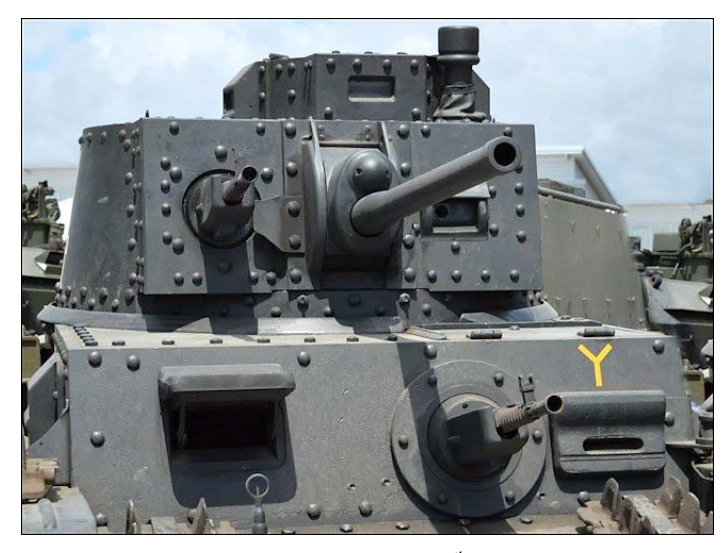
A restored Panzer 38(t) with 7<sup>th</sup> PD markings.

At the opening stage of Operation Barbarossa, the 7<sup>th</sup> and 8<sup>th</sup> Panzer Divisions were still mainly equipped with 38(t)s. In addition, newly formed panzer divisions such as the 19<sup>th</sup>, 20<sup>th</sup>, and 22<sup>nd</sup> were also heavily dependent on 38t for its armored strength. It did not fare well against Soviet armor, but it soldiered on the front lines until well into 1942.