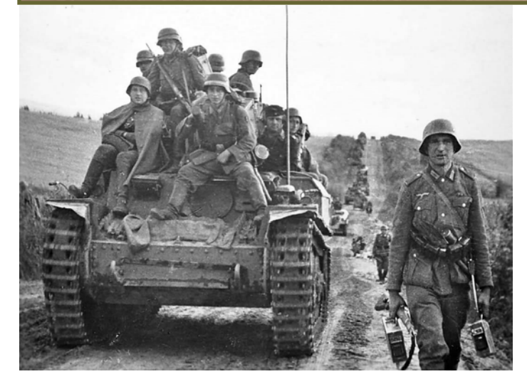
Panzer 38(t) In Russia.

Because it was a reliable tank, the 38(t) continued to serve behind the lines or in reconnaissance roles.