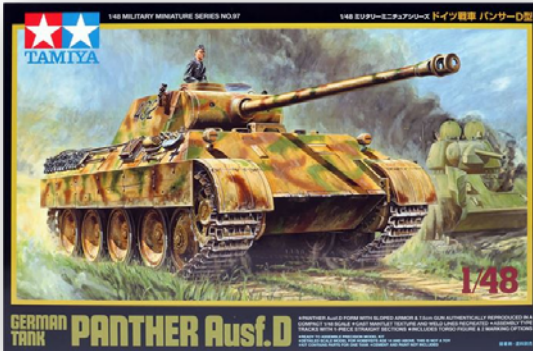
Tamiya's latest 1/48 th release is a Panther Ausf.D. The diecast lower hull is back!