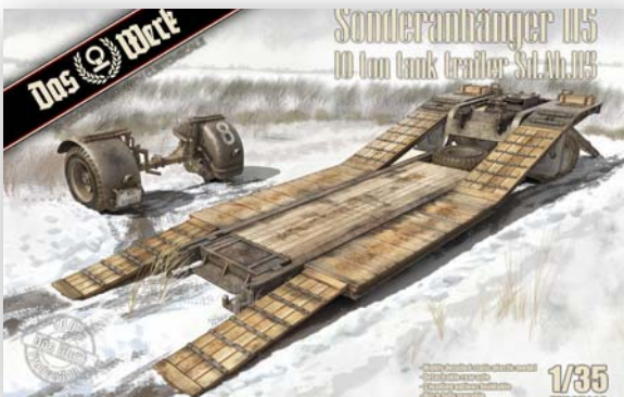
Das Werk's latest is the 10t tank trailer Sd.Ah.115 in 1/35 th scale. Perfect for hauling Tamiya's upcoming 38(t)!