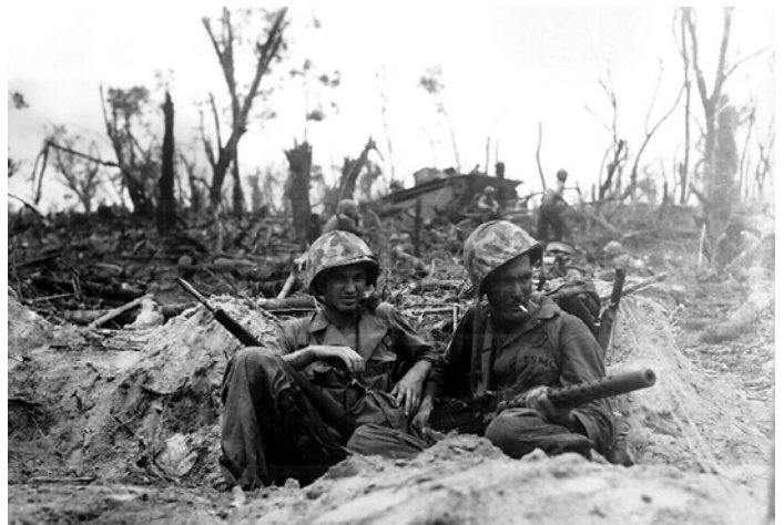
Marines on Peleliu

difficult fight than he anticipated. The Japanese were in the process of changing up their tactics but still fighting virtually to the last man. Both sides would see over 10,000 casualties. However, the killed in action numbers would contrast sharply. Whereas the American troops lost over 2,000 men killed, the Japanese lost over 10,000 killed, which was almost the total number of defenders on the island.