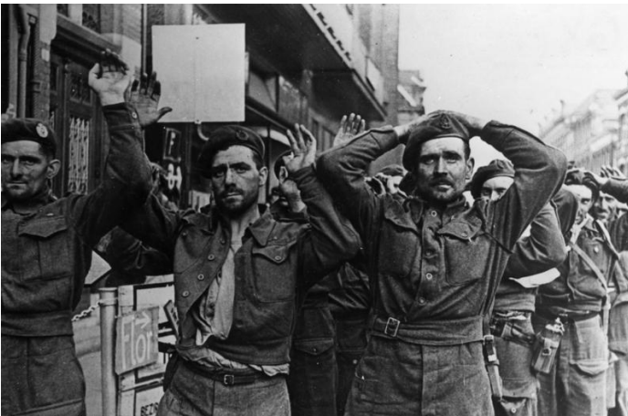
British Prisoners of War

By the time the operation halted on the 25 th of September, SS forces had retaken all of Arnhem and had blunted the Allied armored drive to relieve the British airborne forces. Some of the British and their Polish reinforcements were safely evacuated across the Rhine, but over 6,000 prisoners of war were taken by the Germans, including a large number of "Red Devil" paratroopers. Added to the number of those killed and wounded, the British 1 st Airborne Division suffered a casualty rate of about eighty percent!