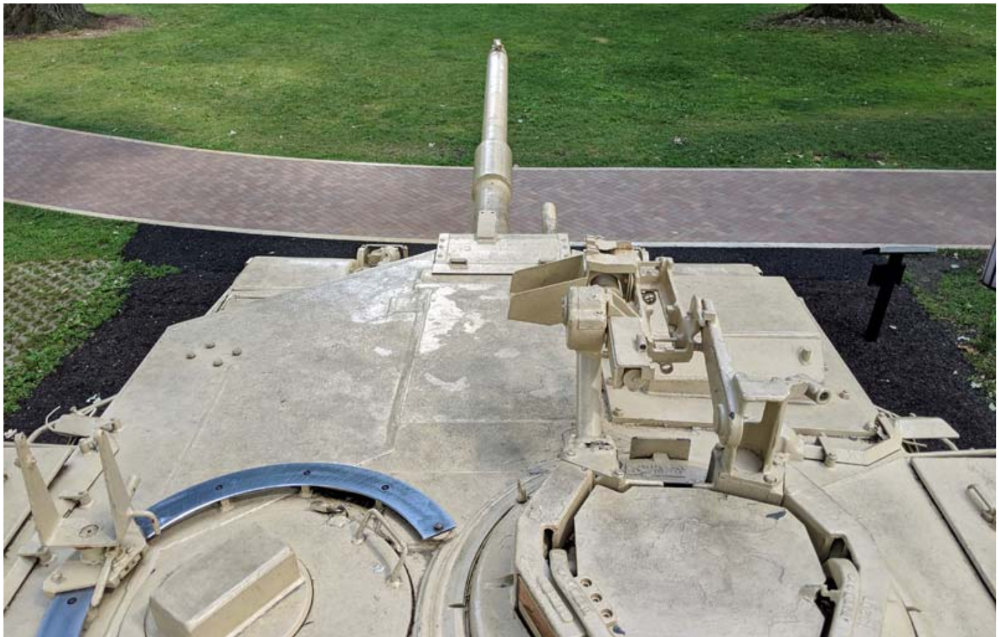
The view from the top of an M1 Abrams. As Mel Brooks said in his film History of the World Part I, "it's good to be the king!"