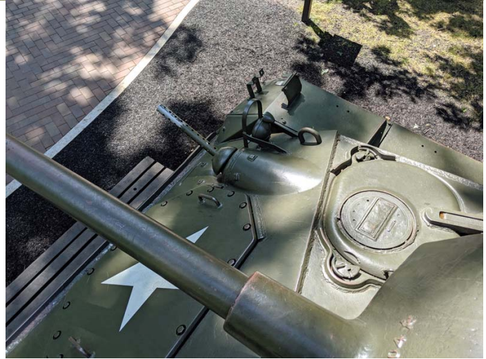
Bow gunner side of an M24 Chaffee.