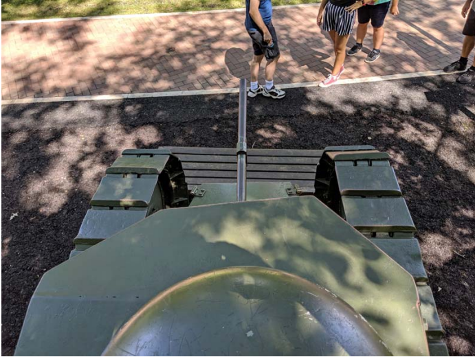
Standing on a hundred years old tank!