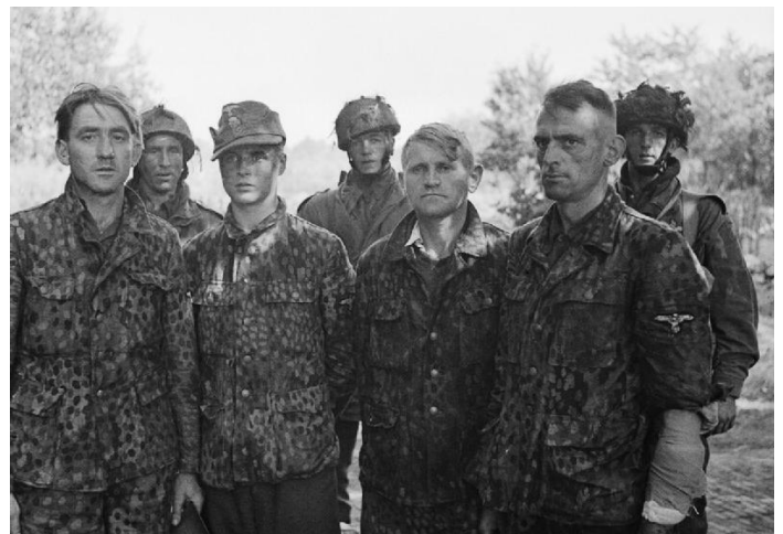
SS prisoners of war during the early stage of Market Garden.

The city of Arnhem was the final objective of Market Garden. The task of taking the Arnhem bridge over the Rhine River was given to the British 1 st Airborne Division, aka the "Red Devils." Unfortunately, as fate would have it, Germany's 9 th and 10 th SS Panzer Divisions were regrouping near Arnhem. It would turn out to be an uneven fight that the Brits had no chance of winning in spite of some initial gains.