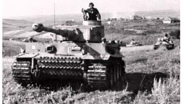
Tiger tanks from the Das Reich SS Division went into battle as did other Tigers from various units. They inflicted a great deal of damage on Soviet defenders but were not able to carry the day.