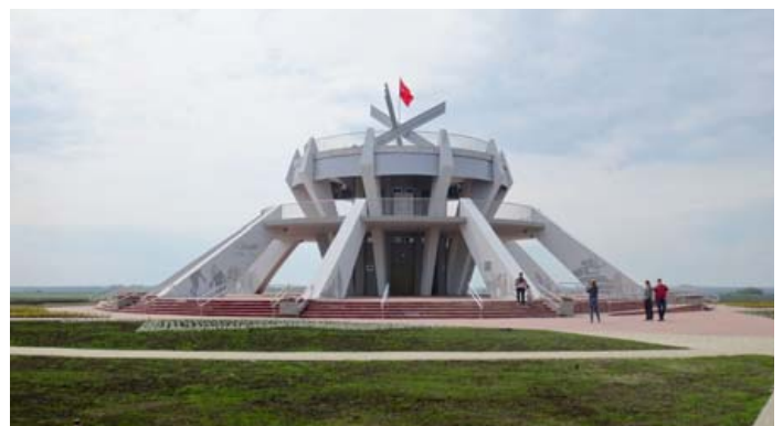
Today Russia has several monuments at different sites around Kursk to honor the success of her military.