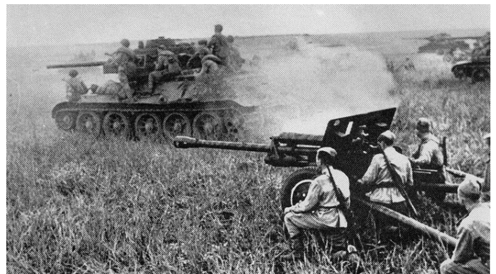
Even before the German offensive stalled, Soviet forces counter-attacked. They suffered heavy casualties, but in the end, Russia was able to replace losses better than her German adversaries.