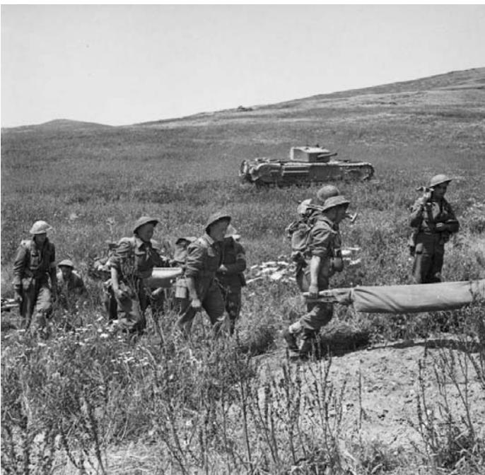
British soldiers at Longstop Hill with a Churchill from the North Irish Horse in the background.

This month's inspirational history is taking us to 75 years ago, in April 1943, during the Battle of Longstop Hill in North Africa. The was actually the Second Battle of Longstop Hill between the British and the Germans, taking place in the same location in Tunisia as a battle the previous December. There are a couple of interesting armor events that took place in this fight.