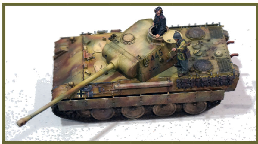
1st Place: Ian Candler 1/35 th Panther D