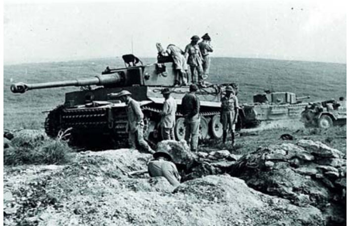
Tiger 131 being inspected by British soldiers.

The first intact Tiger I was captured by the British in fighting that occurred just before the attack on Longstop Hill. Although Tiger 131 was returned to England for study and later became a museum display, there is more recent photo analysis that suggests Tiger 131 was not the first Tiger captured in the lead up to Longstop Hill.