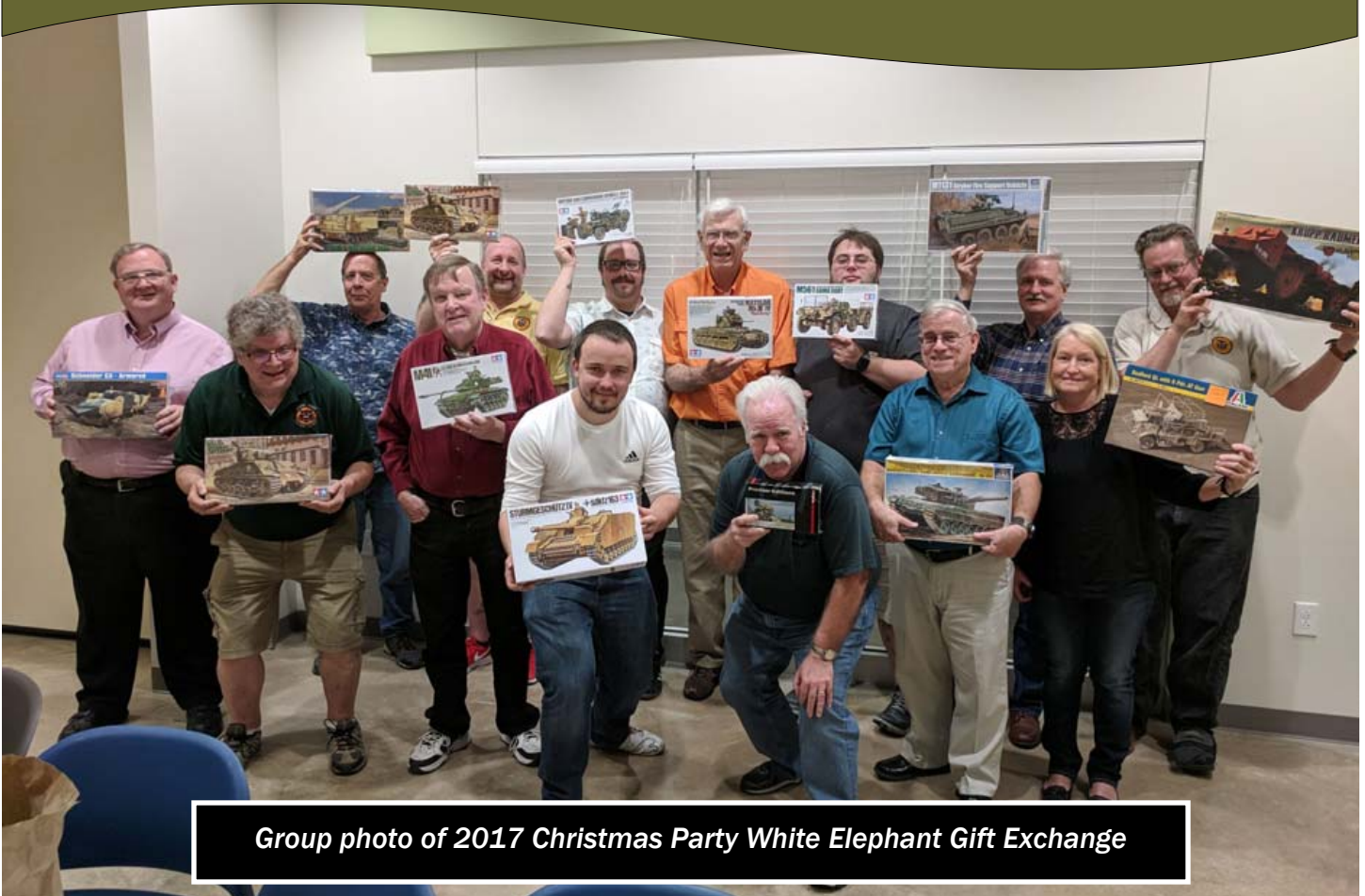
Group photo of 2017 Christmas Party White Elephant Gift Exchange