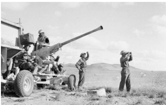
The crew of a 40mm Bofors gun watch the sky after a Stuka attack during the British advance on Tripoli, January 29, 1943.

Searching for inspiration for you all to spend the new year's modeling time, I looked at the Western Desert of North Africa seventy-five years ago, a time period and locale that I rarely consider. The British launch a new effort to take Tripoli in January 1943.