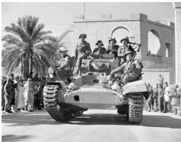
A Gordon Highlanders piper plays on a Valentine as it drives into Tripoli, January 26, 1943.

Montgomery had built up a huge advantage in numbers of everything needed to fight and, with the German's poorly supplied and not well supported, the British effort had little to overcome and frequently turned into a pursuit more than a battle.