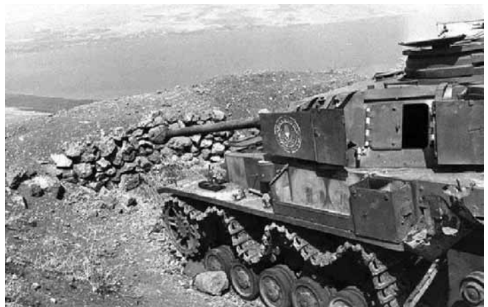
A Syrian Panzer IV destroyed in the Golan Heights during the Six Day War