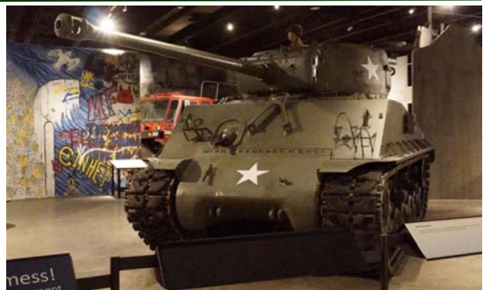
This “Easy-8” inside the museum is in much better shape.