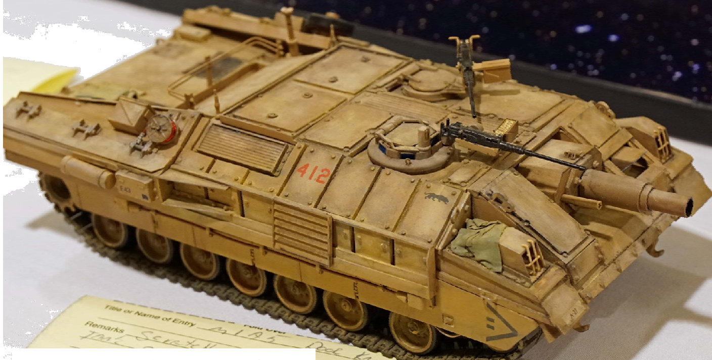
A "futuramor" at this year's Wonderfest: 1/35th M1A5 "Door Knocker"