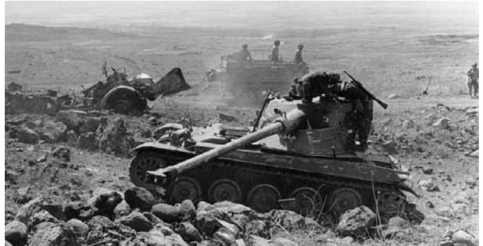
Israeli armor during the Six Day War: a French-made AMX-13 with an American M3 halftrack driving past.

The Six Day War is an amazing smorgasbord of armor. Both sides had both relatively modern and antique armor from many different world-wide suppliers. A modeler could build a T55, an M48, a Sherman, a T34, an M3 halftrack, and yet remain accurate to the actions in the war. The Syrians had even acquired captured German Panzer IVs from France and Czechoslovakia! It seems almost unreal to see or read about armor from WWII era in action in the 1960's.