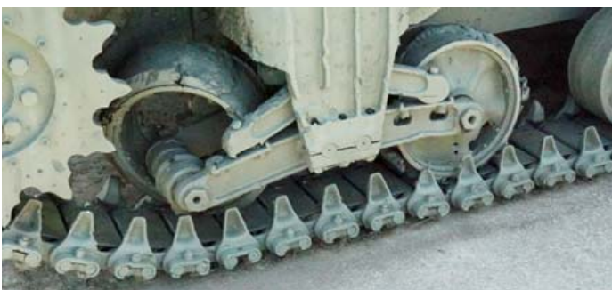
Sitting right outside the front door is an M4 Sherman in very bad shape.