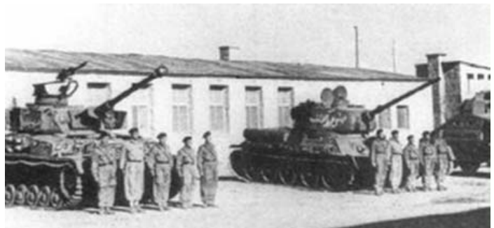
A remarkable image taken before the Six Day War of Syrian crews for both a Panzer IV and a T34.

I'm looking forward to seeing you all and your projects, so be careful transporting them to the meeting on Wednesday night. We don't need any more broken mirrors, head lamps, or track links!