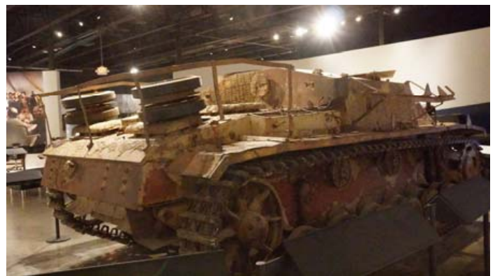
A real StuG III with waffle-pattern Zimmerit! This StuG bogged down in the marshes along Lake Khudobelkino during maneuver in northern Russia in March 1944. The German abandoned it as they retreated westward.

Shortly after the StuG sank to the bottom of the marshy lake and lay underwater for 50 years until recovered in April 1994. It was purchased by a collector and donated to the museum.