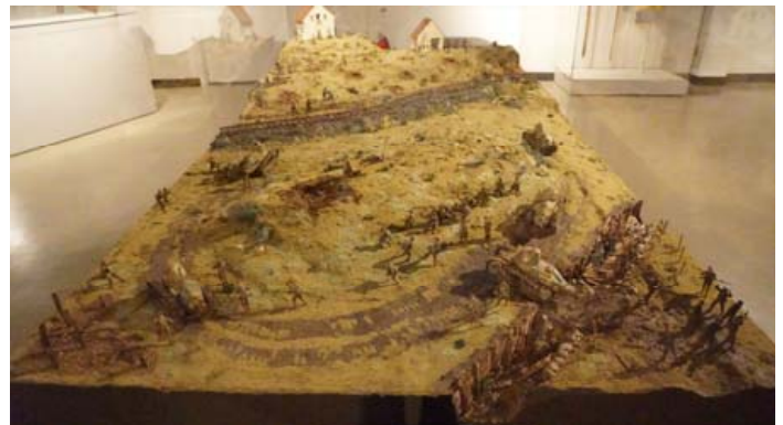
A WWI diorama in 1/35th scale

The Peacemaker was purchased by Patton in El Paso, TX in 1916. He carved two notches on the grip for each of the Mexican bandits he claimed to kill during the Punitive Expedition.