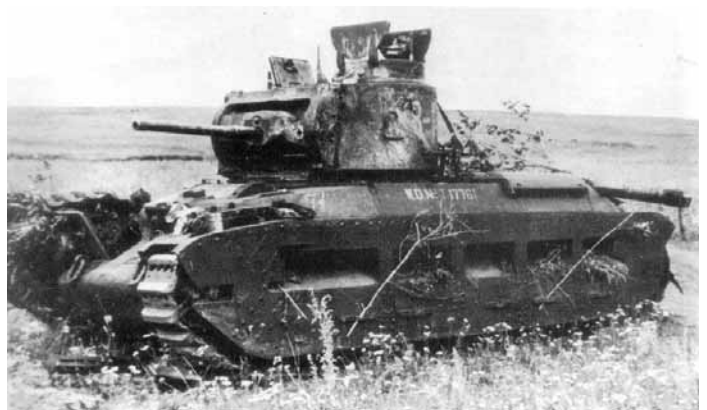
A Russian Matilda knocked out near Kharkov, May 1942

As always, I'm looking forward to seeing what everyone has been up to for the last month at the club meeting on Wednesday. Unfortunately, it will be May 3 rd , so we'll just miss being able to geek out with a "May the fourth be with you" greeting!