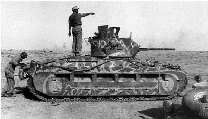
A German Matilda preparing for the Gazala offensive, May 1942

In the historical inspiration department, I found a fun tie-in between the two major tank battles that occurred 75 years ago this month. Those battles were the Battle of Gazala and the second Battle of Kharkov. The interesting fact is that there were British Matilda tanks used by both the Russians and Germans. Of course, that would be the Germans at Gazala and the Russians at Kharkov.