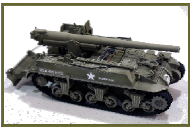
2nd Place: Alex Gashev 1/35 th US M12 Gun Motor Carriage