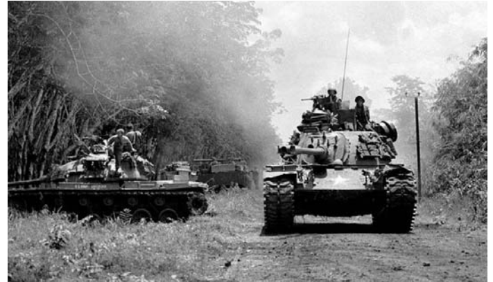
US Armor in Operation Junction City