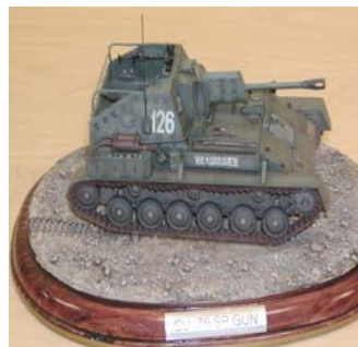
Soviet SU76M