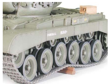
Tamiya M26 Pershing