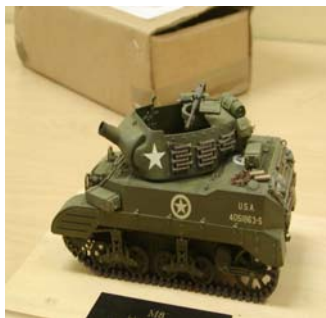
M8 Motor Carriage (Tamiya)