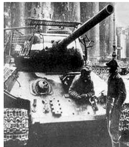
T34/85 with mesh wire "Bedsprings" in front of the German Reichstag, Berlin Germany 1945.