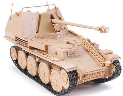
Tamiya Marder III M