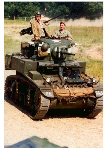
M3A1 Stuart Light Tank