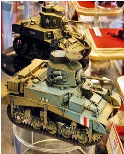
Academy M3 “Honey” and M3A1 Stuart Light Tanks (1/35)