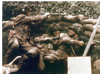
Band Of Brothers