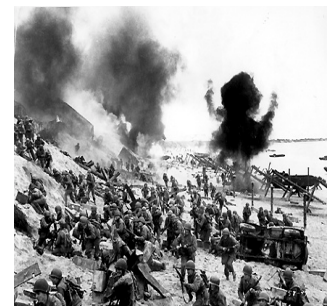
The Longest Day