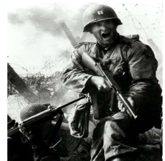
Saving Private Ryan