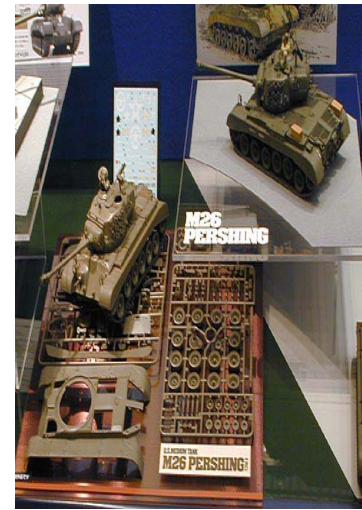
Tamiya M26 Pershing (1/35)