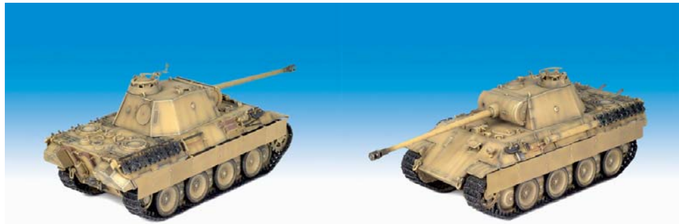
Dragon Panther A Early Type