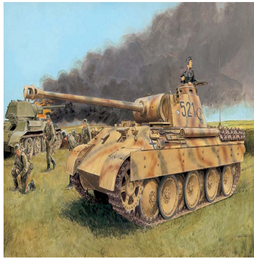
Dragon Panzer D (1/35)